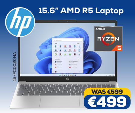
• 8GB RAM • 256GB SSD • FHD display