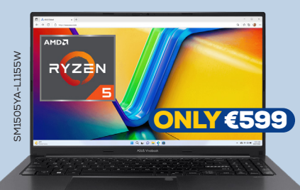
• 8GB DDR4 RAM • 512GB SSD • FHD display