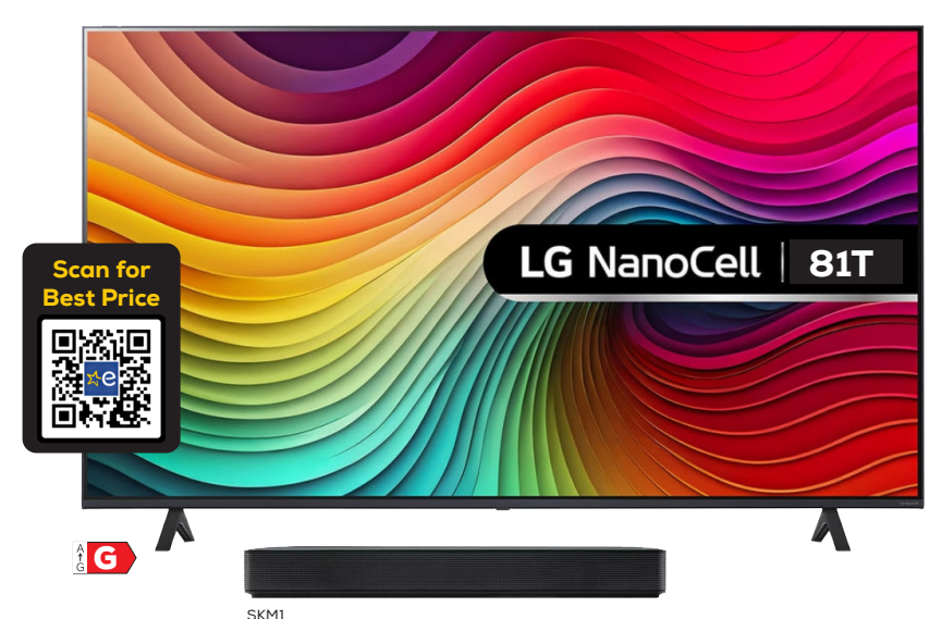
2.0ch Soundbar with Bluetooth