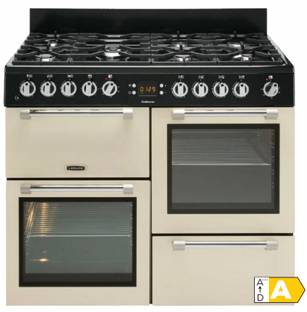
Also available in Black or Anthracite