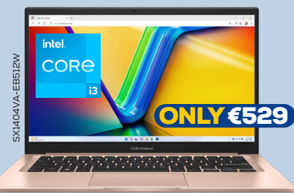
• 8GB DDR4 RAM • 512GB SSD • FHD display