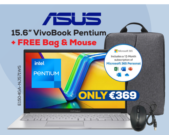
• 4GB RAM • 128GB SSD • FHD display