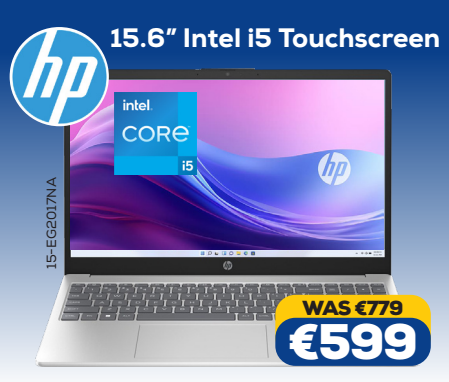
• 8GB RAM • 512GB SSD • FHD display