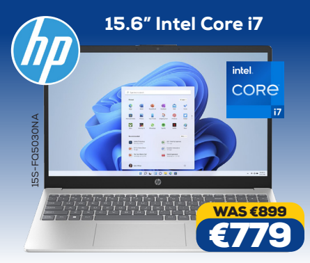
· 8GB RAM · 256GB SSD · FHD display