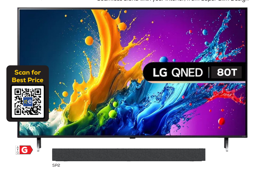
2.1ch All-in-One Soundbar