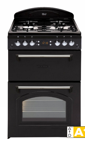
Also available in Cream