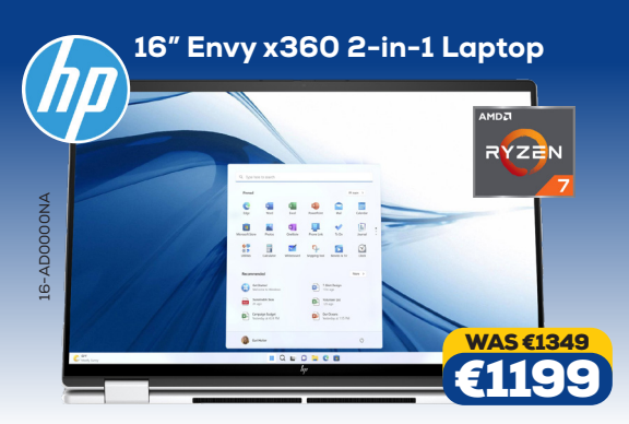
• 16GB RAM • 1TB SSD • AMD R7 • AI technology