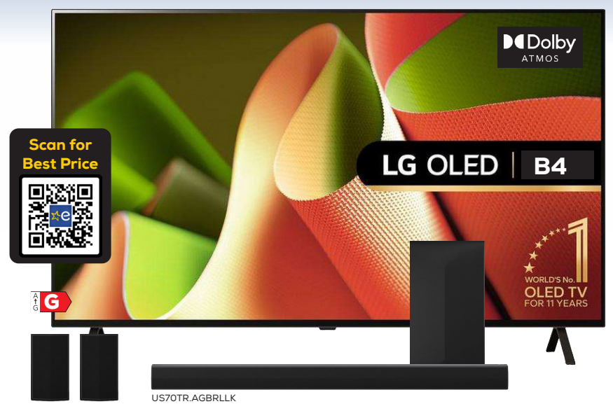
5.1.1ch Soundbar with Surround Speakers